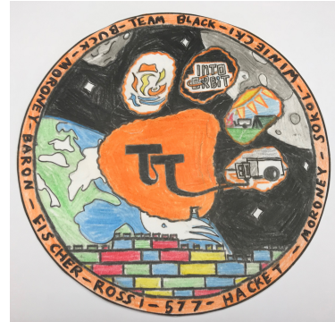
Tiger Tech Mission Patch Example

Instructions to Team: Developing a team identity is important because it helps your team understand who they are and what they represent. Your goal is to create a mission patch to represent your team identity. Below are sample NASA mission patches that are to be used as examples.